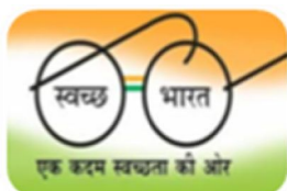
SWACCH BHARAT MISSION