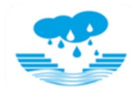
JAL SHAKTI ABHIYAN