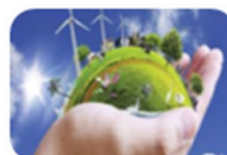
ENERGY CONSERVATION AND RENEWABLE ENERGY